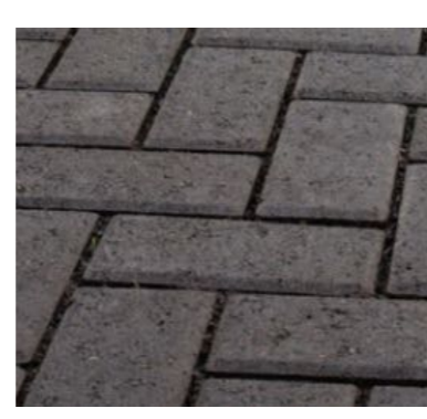
PERMEABLE PAVING EG FIRTH FLO PAVE