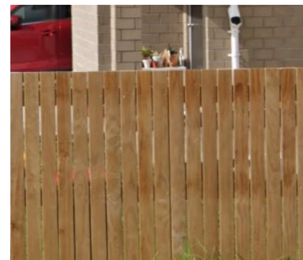
90MM VERTICAL PALING TIMBER FENCE