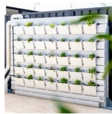
THIN POTS VERTICAL GARDEN SYSTEM ATTACHED TO SW TANKS