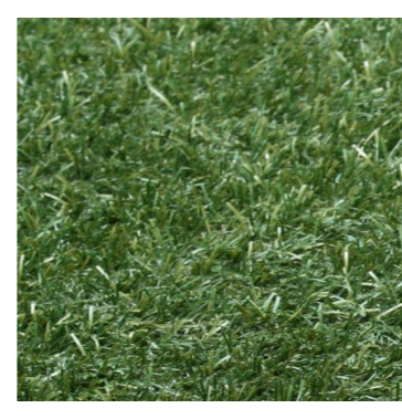
TURF NOTE: PRODUCT SELECTED MUST BE PERMEABLE MIN 30MM PILE HEIGHT, RESEMBLE GRASS, RESISTANT TO ULTRA VIOLET DEGRADATION & AGEING, AND BE RECYCLABLE