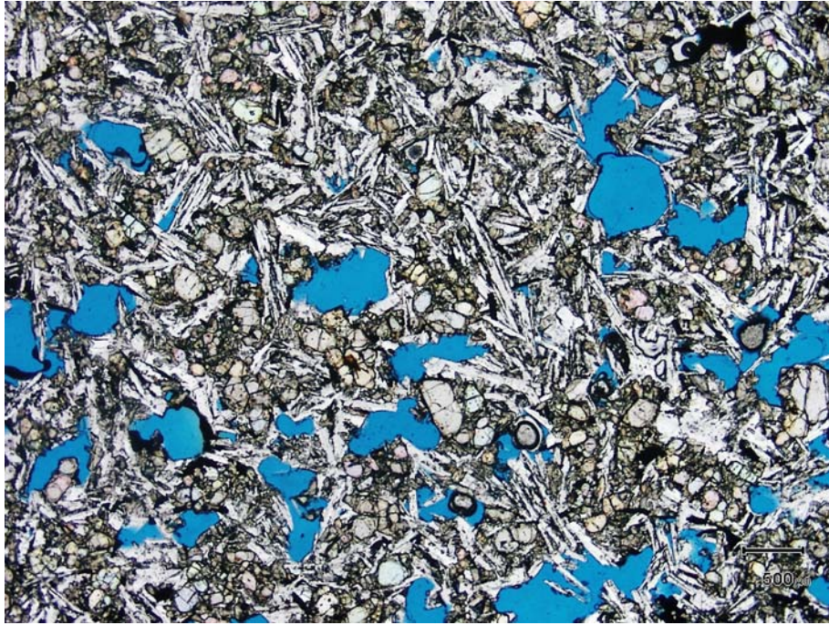
Fig 1 Bamstone Bluestone (B90/34)

Transmitted light, thin section (TS). Relatively low magnification X20 (bar scale 500µm), ordinary light (OL). Random field of view typical of this whole thin section, massive crystalline basalt with abundant random and loosely interlocking thin lath-form microlites of plagioclase (white). Scattered microphenocrysts of olivine, and finer crystalline clinopyroxene interstitial (groundmass).