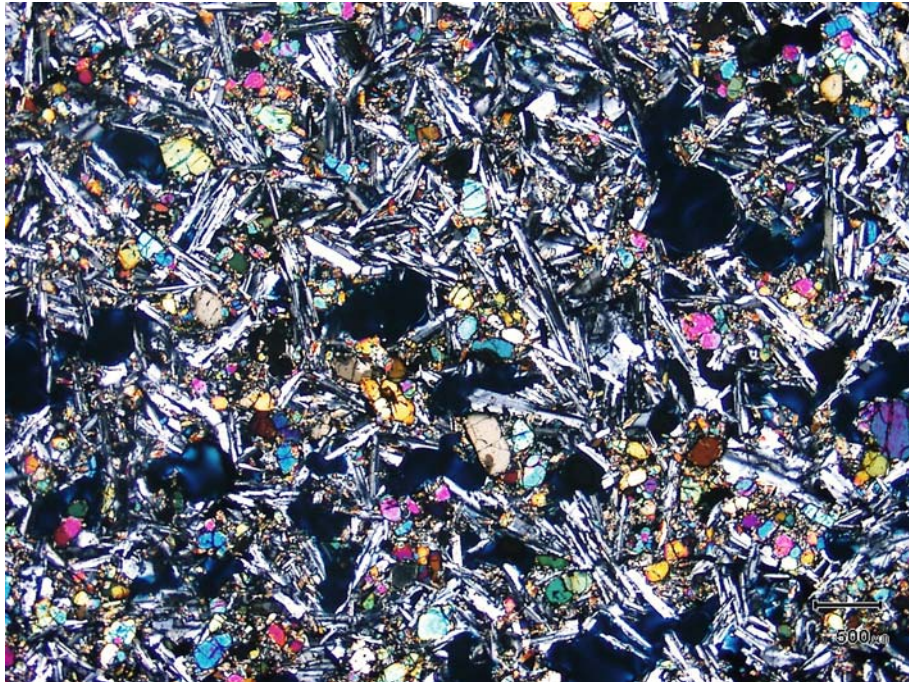
Fig 2 Bamstone Bluestone (B90/34)

Transmitted light, thin section (TS). Relatively low magnification X20 (bar scale 500µm), ordinary light (OL). Random field of view typical of this whole thin section, massive crystalline basalt with abundant random and loosely interlocking thin lath-form microlites of plagioclase (white). Scattered microphenocrysts of olivine, and finer crystalline clinopyroxene interstitial (groundmass).