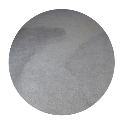
This is what a cut pile carpet can look like if shading occurs

Cut pile carpets, particularly plush pile carpets, may develop lighter or darker patches over time. Known as 'shading', 'puddling' or 'watermarking', it is caused by the permanent bending of the carpet pile fibres which then reflect the light differently. Brushing or shampooing does not reduce shading. The extent to which shading occurs cannot be accurately predicted or prevented. It does not affect the wear or durability of the carpet and is not recognised by Bremworth as a manufacturing flaw or defect.