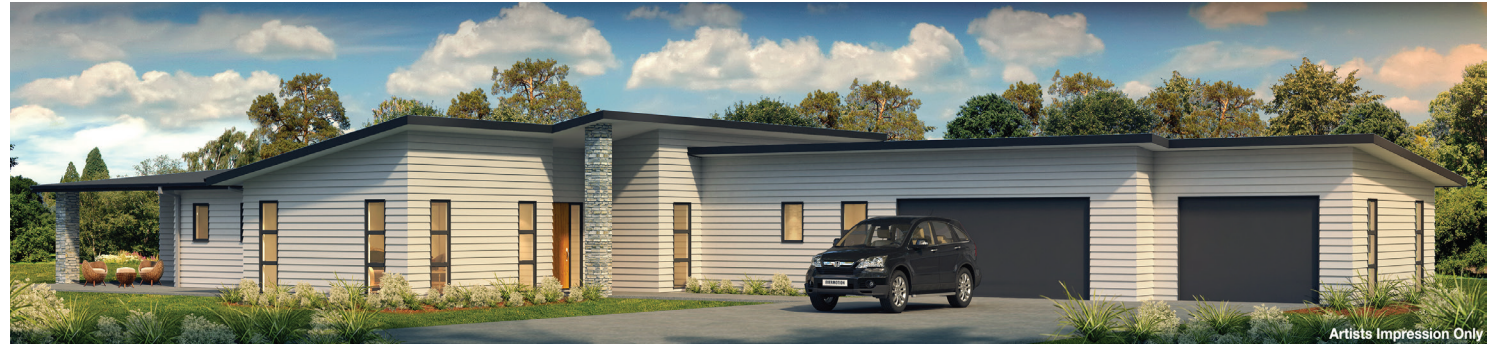
Artists Impression Only