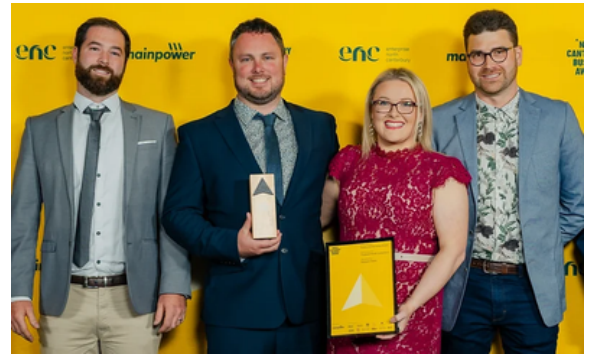
Designer Gates: Winners of the ENC Trades and Services Award 2023