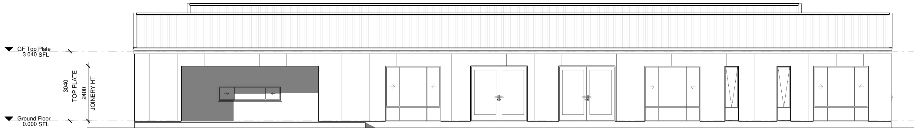
2 LEFT ELEVATION 1 : 100