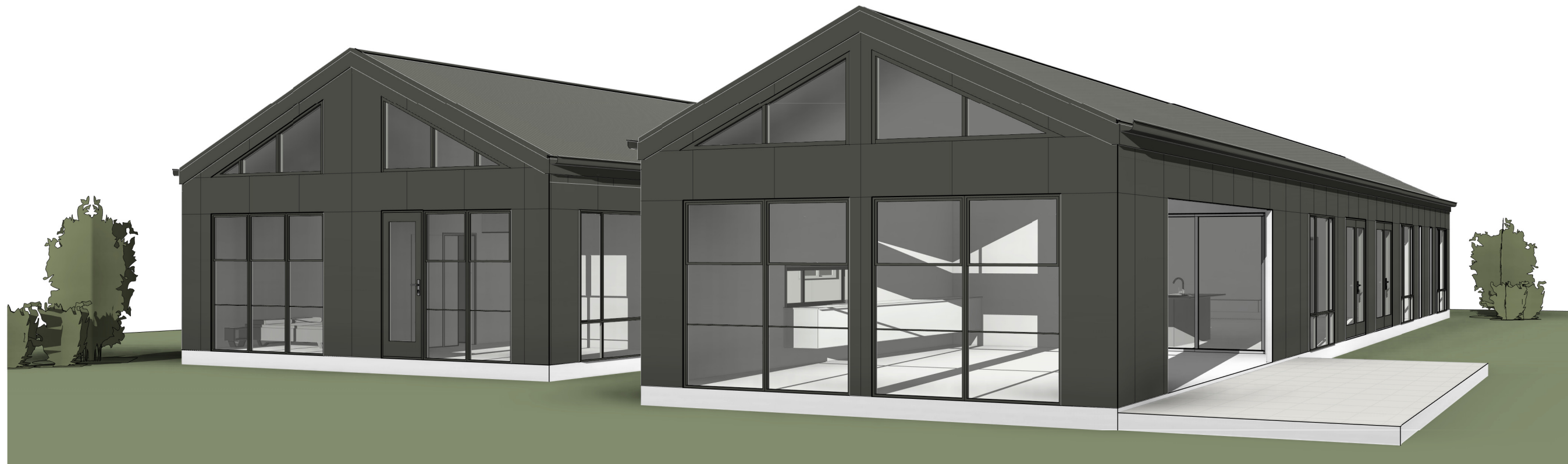
Illustration of Design