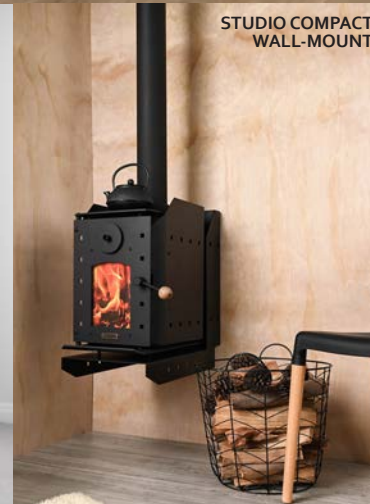
STUDIO COMPACT WALL-MOUNT