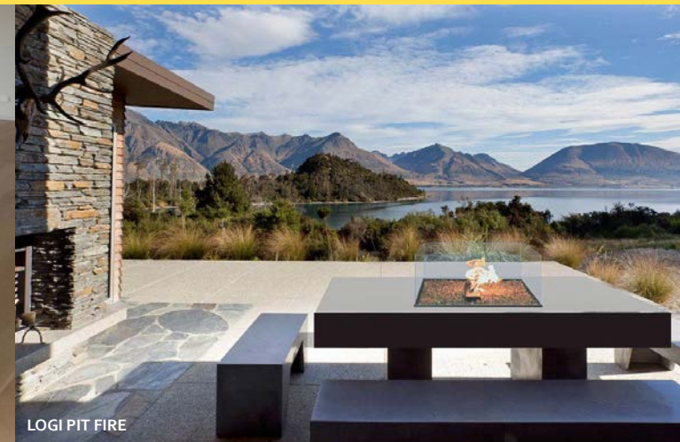
LOGI PIT FIRE