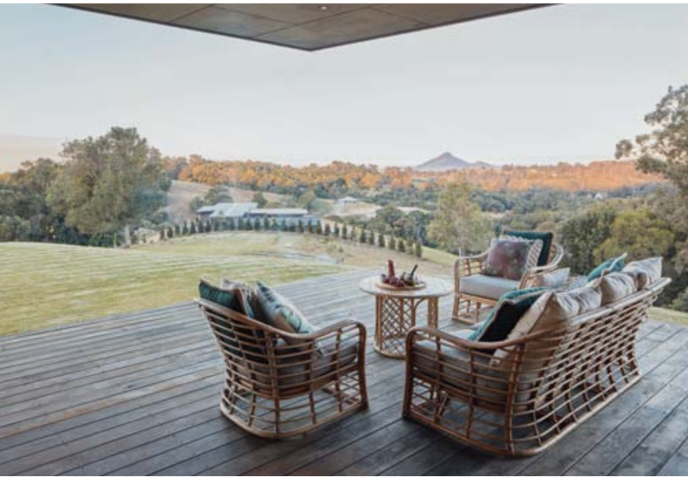
LEFT The entertaining deck is the perfect spot to watch the sun rise BELOW Every room in the house offers fantastic views, including each of the four bedrooms

Internally, the home is spoilt with natural beauty. Forget “a room with a view” — all the rooms have views, even the loo! The structure’s contemporary form is softened with a palette of timber and stone. Most impressive is the timber flooring, which was constructed using recycled Chinese doors. These rustic floors are visually stunning, hardy and forgiving of dirt and sand.