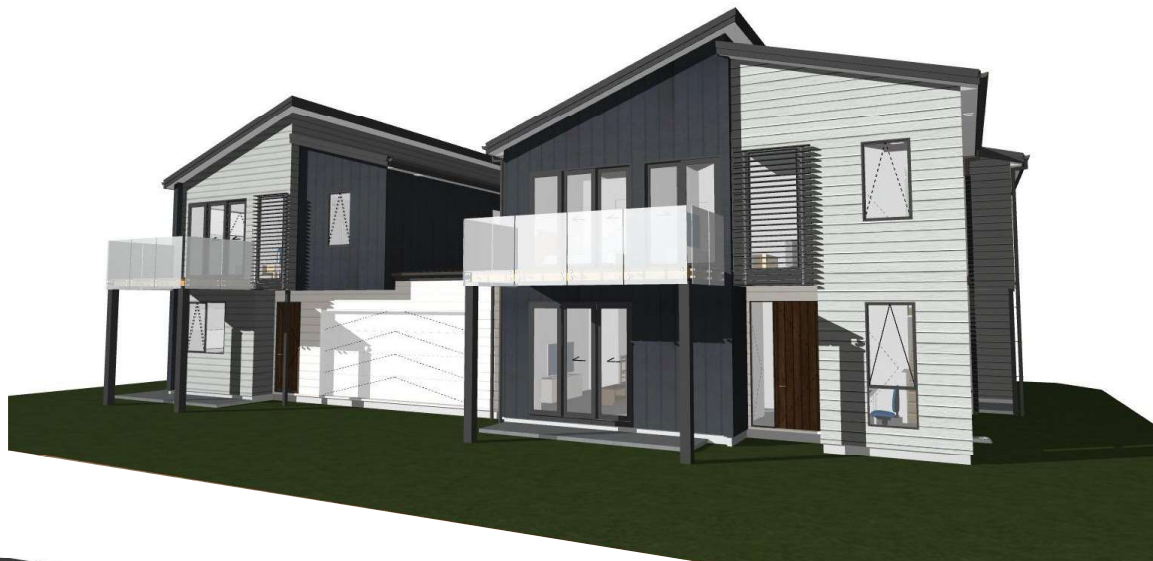
Lot 1-2 Front Perspective