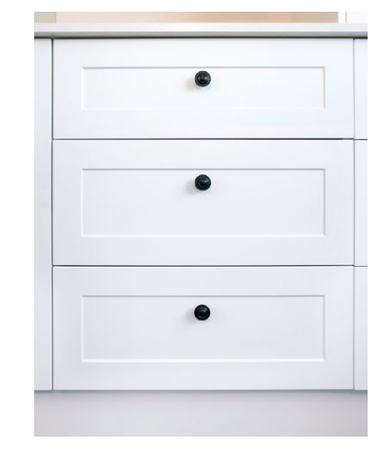
B Individual Fronts