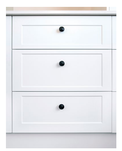
C Individual Fronts with Split Centre Rails