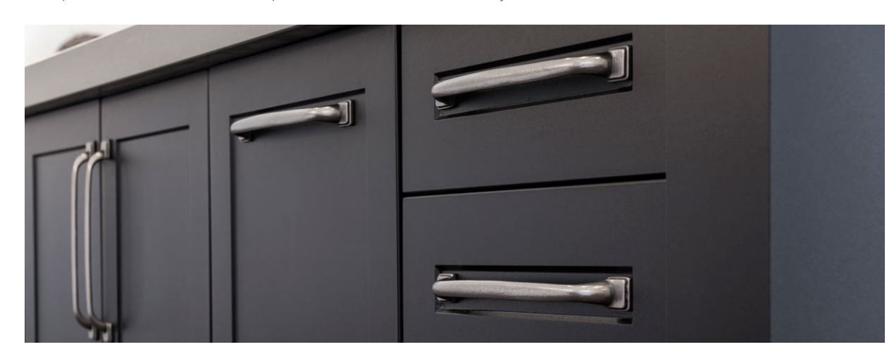
Dark colours will show marks and fingerprints more than lighter colours. Dark colours will also require more care and maintenance than lighter colours. It is recommended to view a physical colour sample prior to colour selection.

Many of the Durostyle colours can be matched with a colour from Panelform's melamine Touchtex range for end panels, toe kicks and open cabinets. Please visit www.panelform.co.nz for the full Durostyle colour selection and a list of colour matches available.