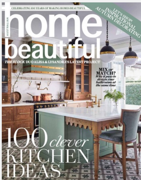
Home Beautiful, March 2025 Cammeray House