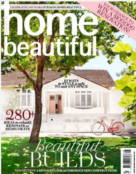
Home Beautiful, August 2025 Mosman House Four