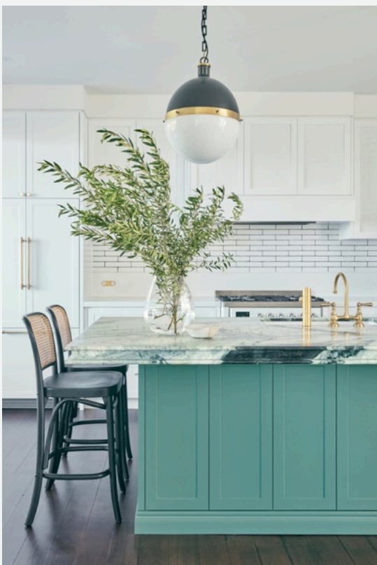
Mosman House Four