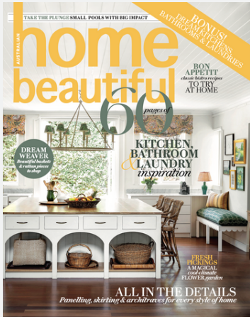
Home Beautiful, Sept 2023 Roseville House