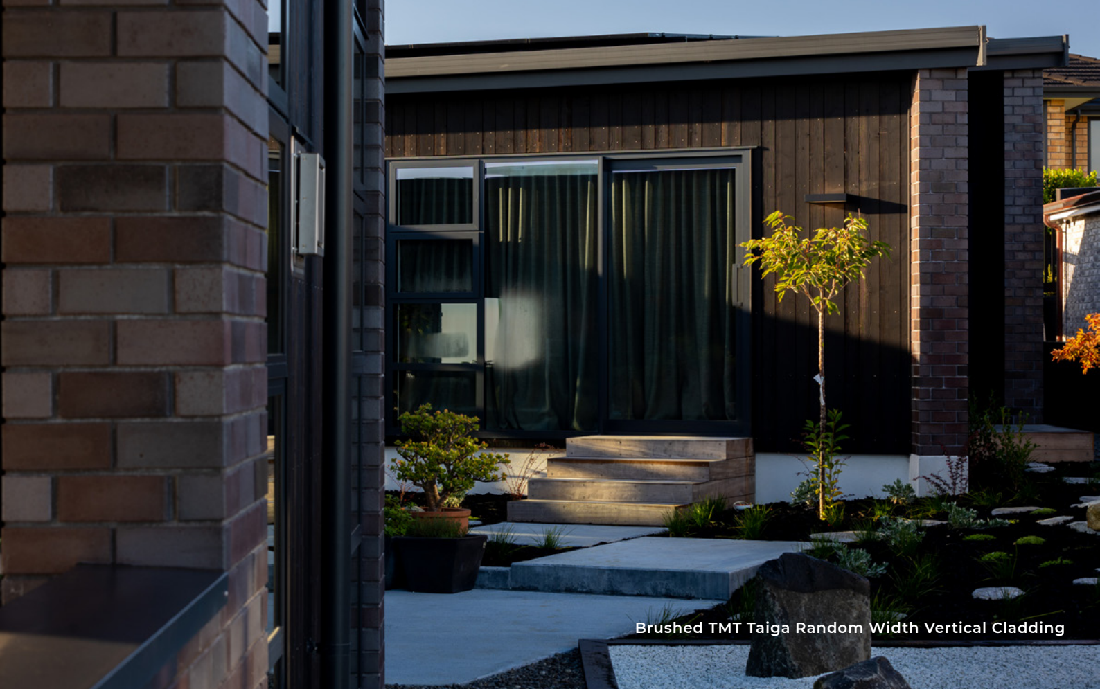
Brushed TMT Taiga Random Width Vertical Cladding