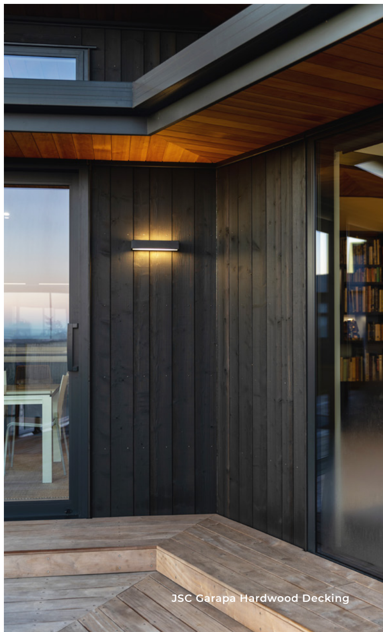
JSC Garapa Hardwood Decking

The sleek vertical shiplap design, combined with the dark palette and textured finish, creates a striking visual statement that harmonises effortlessly with the warm timber ceilings, black brick accents, and aluminium-framed glazing.