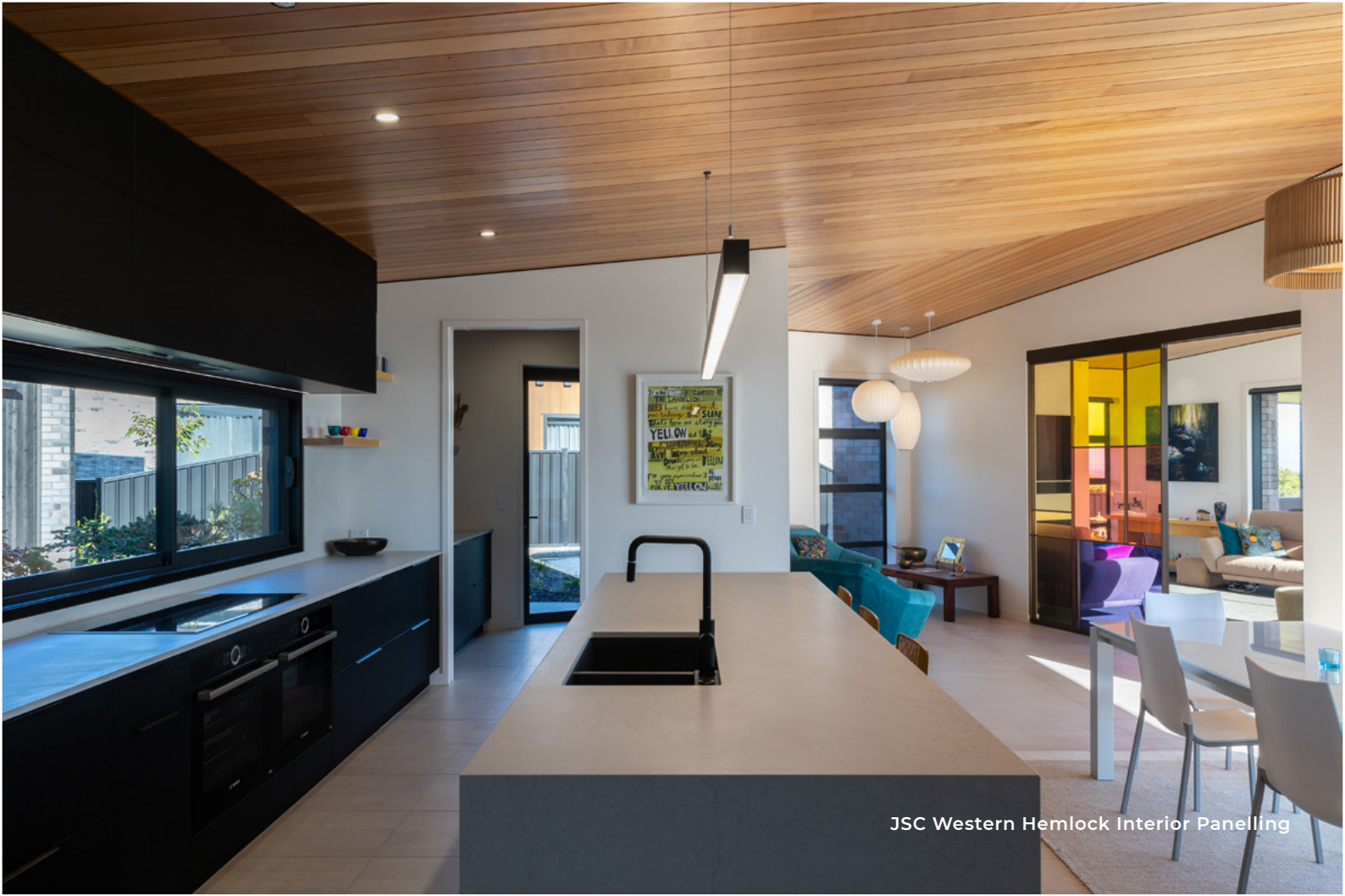
JSC Western Hemlock Interior Panelling