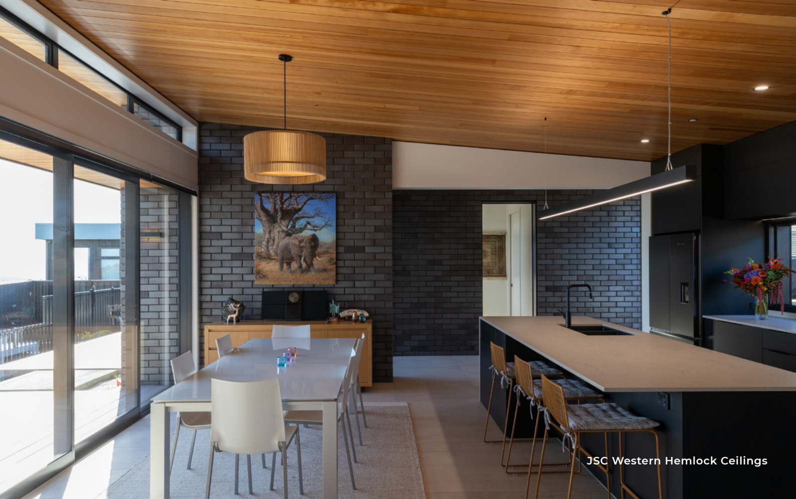
JSC Western Hemlock Ceilings