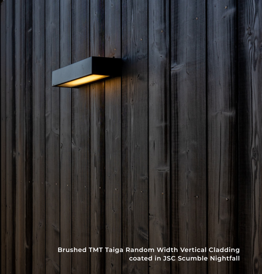
Brushed TMT Taiga Random Width Vertical Cladding coated in JSC Scumble Nightfall