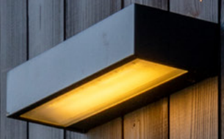
Brushed TMT Taiga Random Width Vertical Cladding coated in JSC Scumble Nightfall