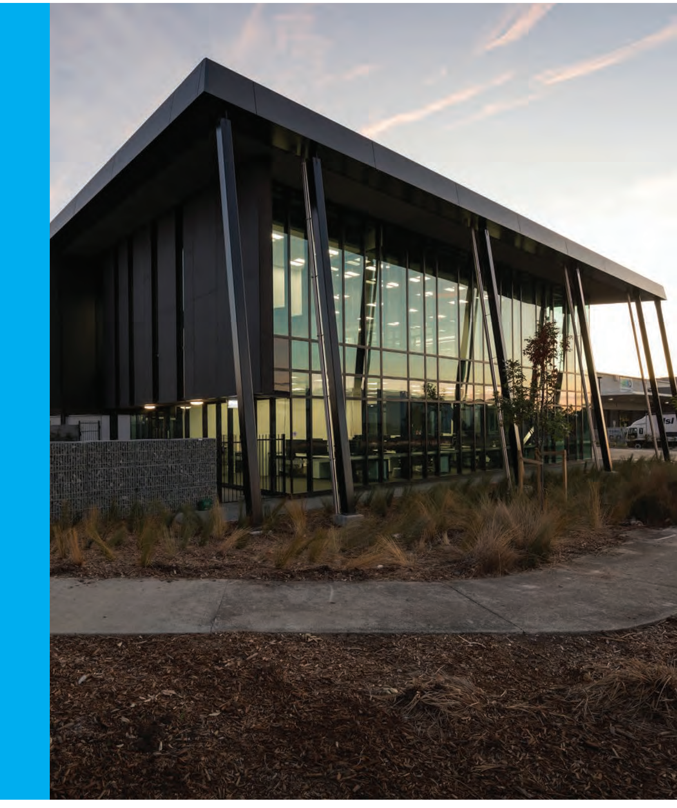
19 Timberly, Auckland Airport

How do we do it? By being flexible and solutions focused. When something crops up to change your project's plans, we'll work with you to come to the best possible solution. Our tight-knit and proven team offer the right blend of expertise, and our close relationships with our key suppliers and sub-contractors mean the right people are always at hand to adapt to challenges and changes.