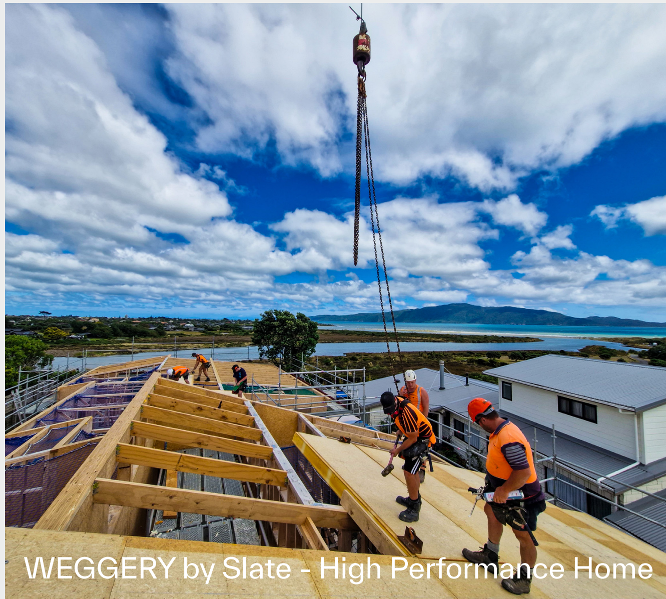
WEGGERY by Slate - High Performance Home