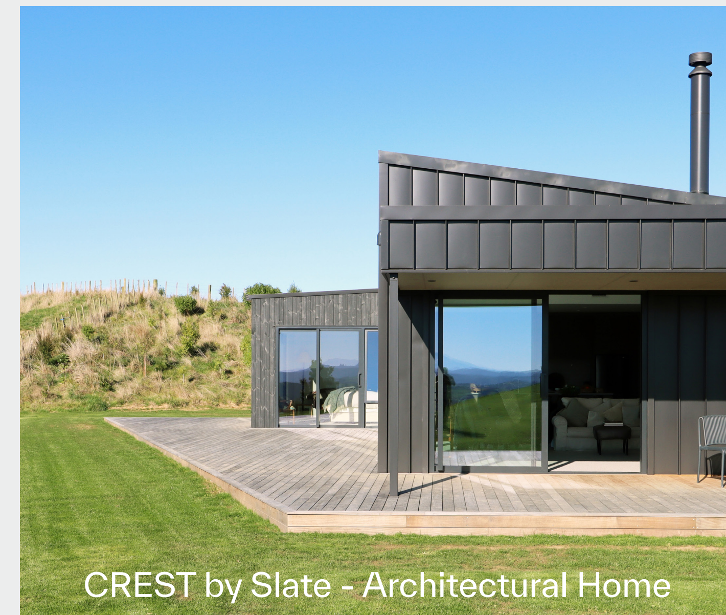
CREST by Slate - Architectural Home