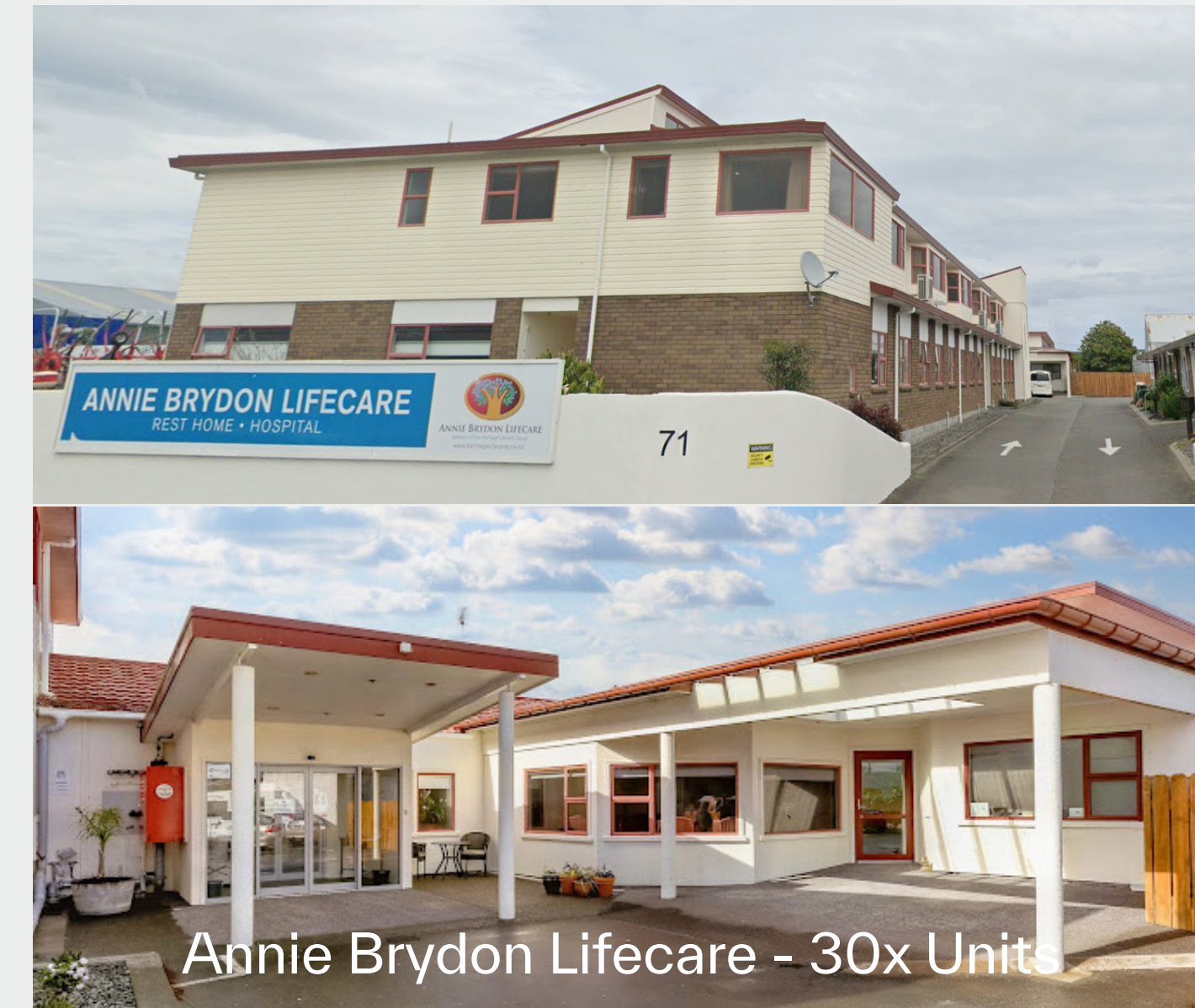
Annie Brydon Lifecare - 30x Units