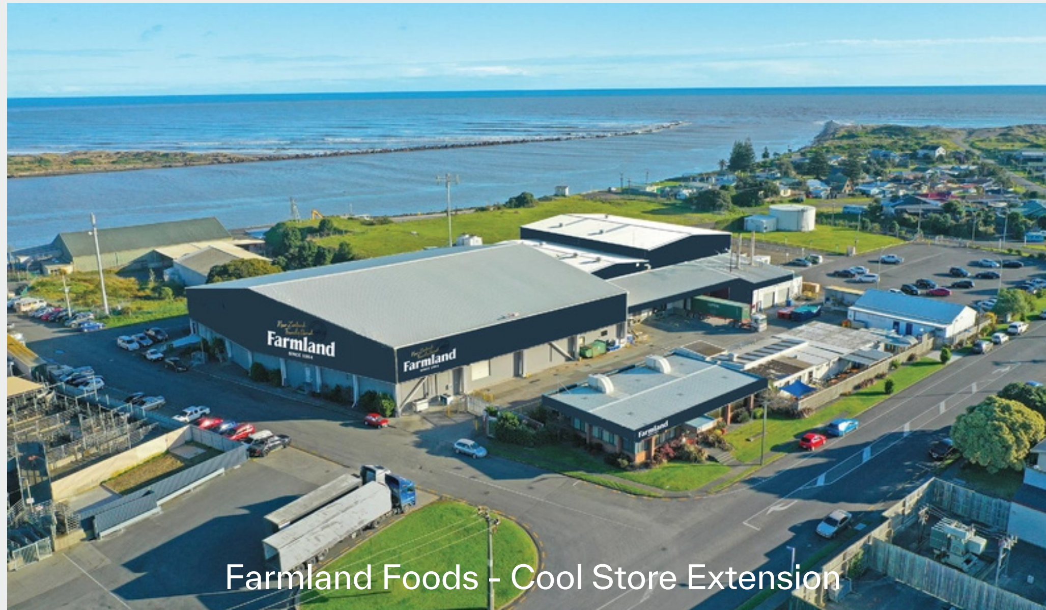
Farmland Foods - Cool Store Extension