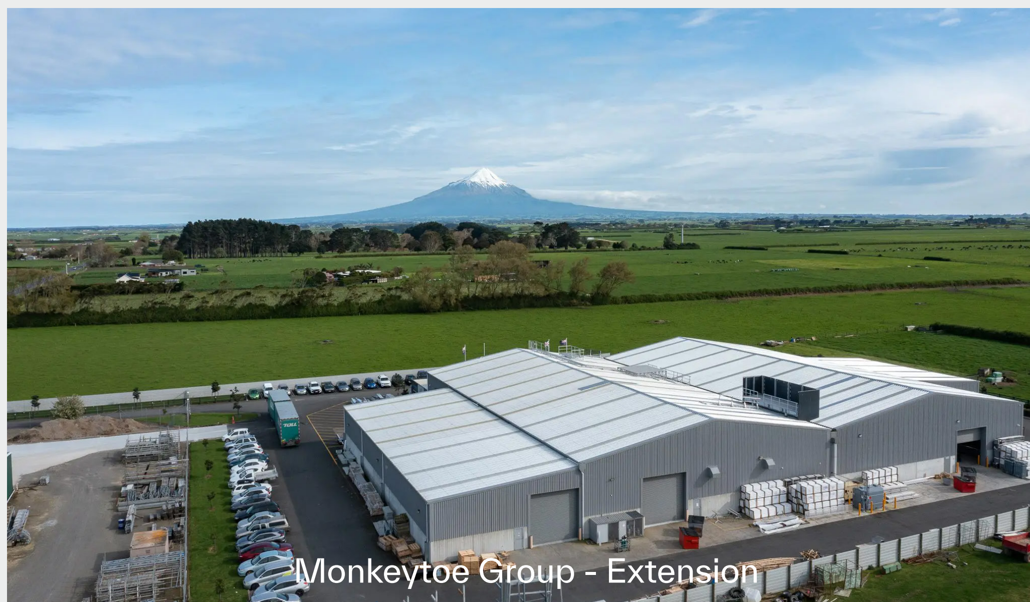
Monkeytoe Group - Extension