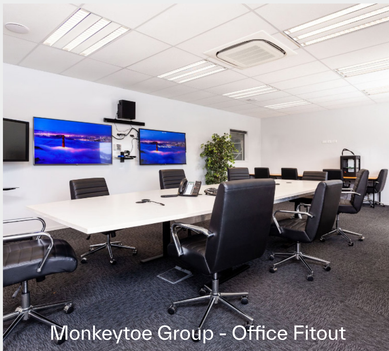
Monkeytoe Group - Office Fitout