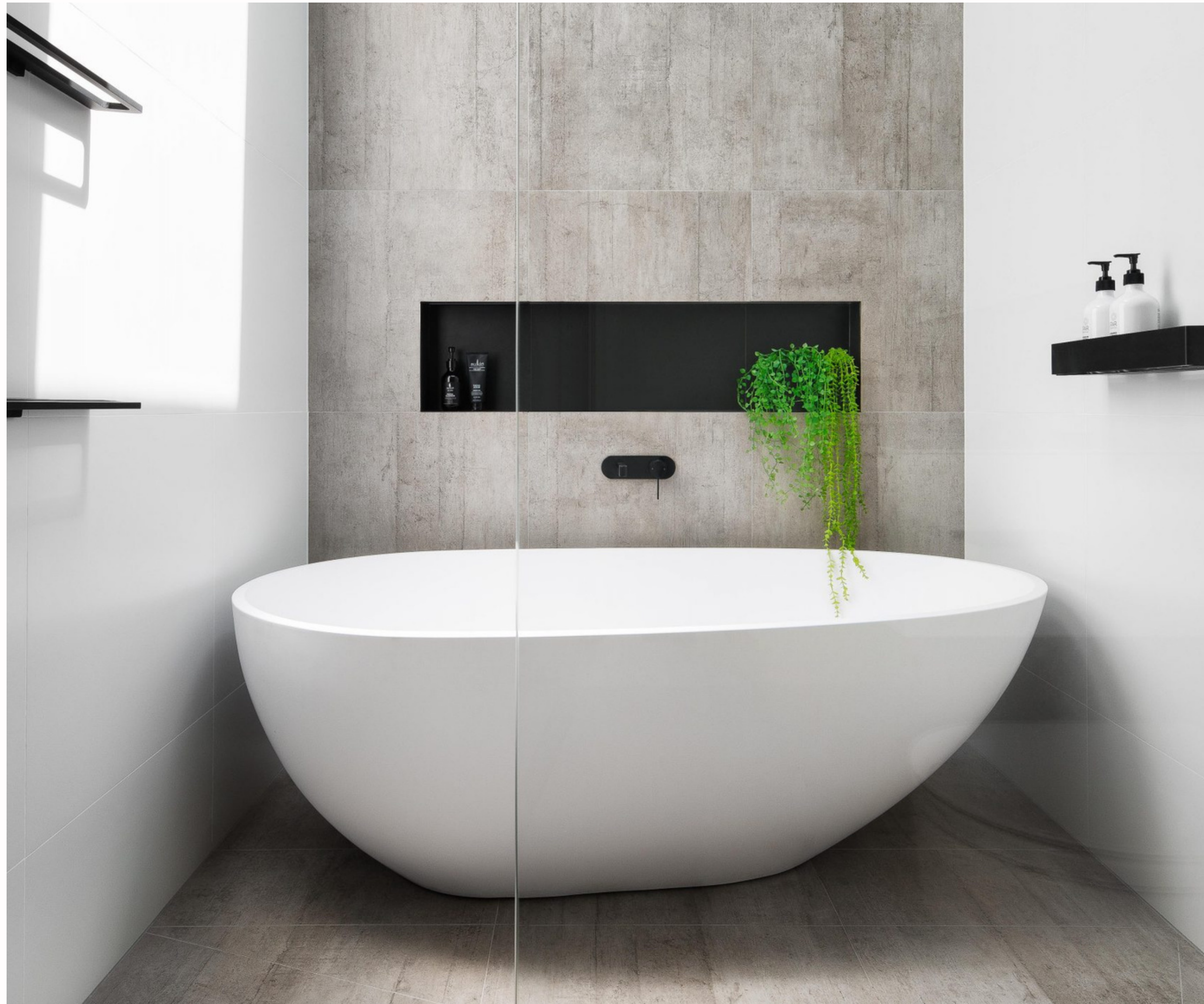
Jolanda ST03 1500 1500 x 770 x 520mm