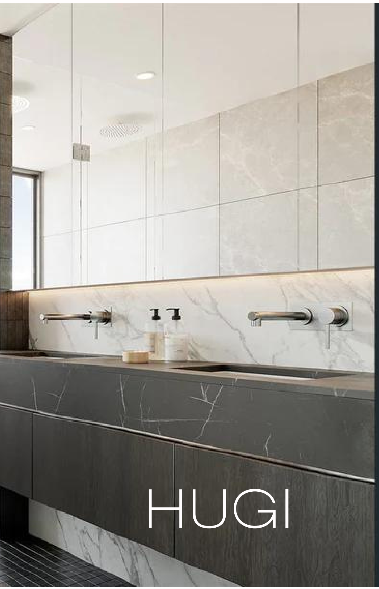
B034A 1500 x 640 x 860mm