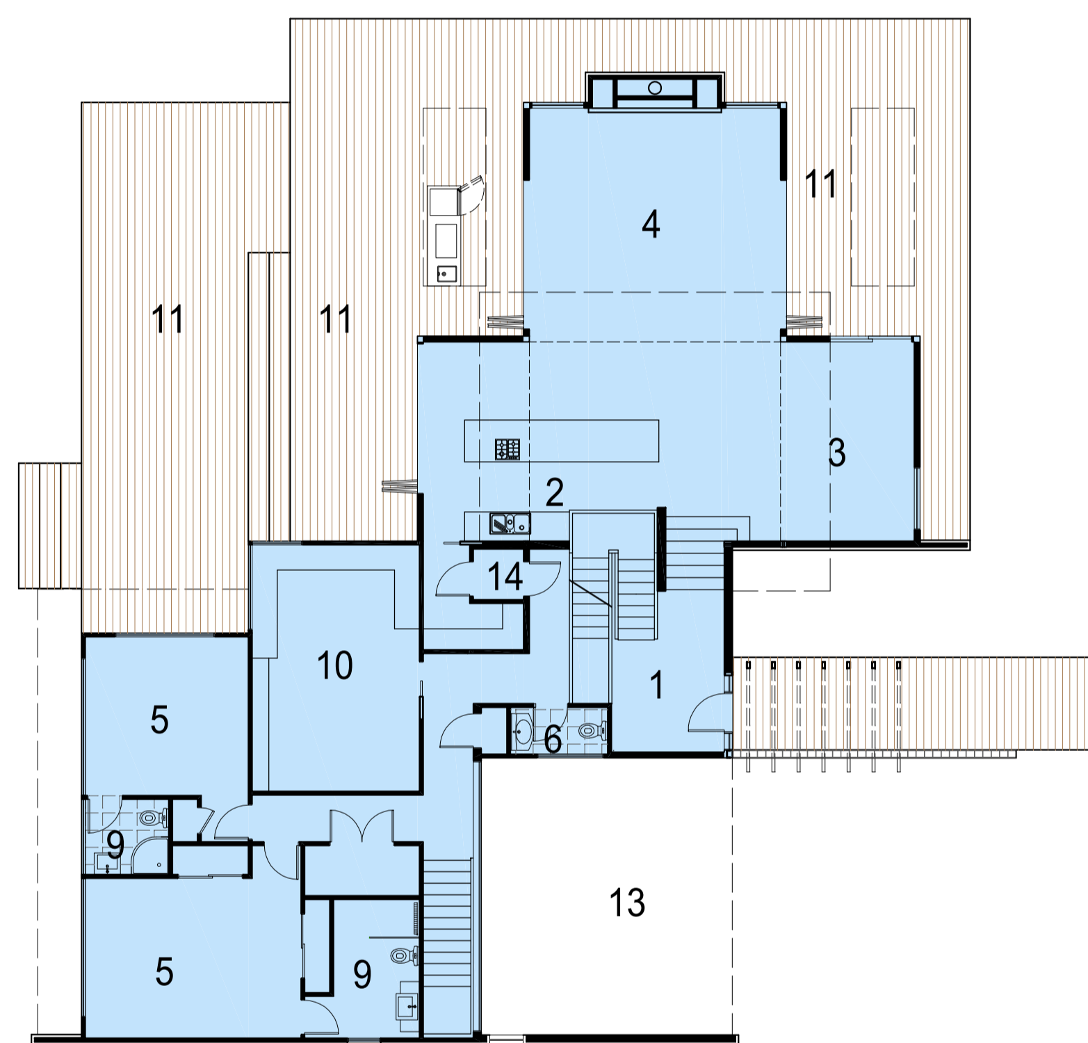
middle level plan