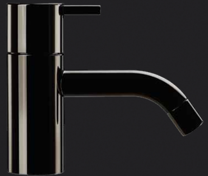
Deep Brilliant Black