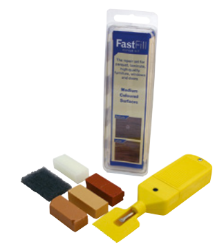
HW650011 Wax Repair Kit