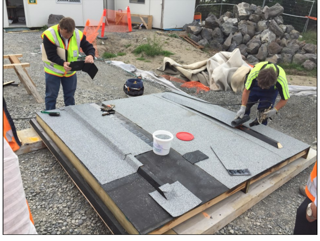
Preparation of the Duo mock roof