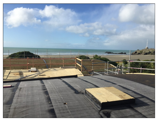
Installation of the Duo basesheet over plywood