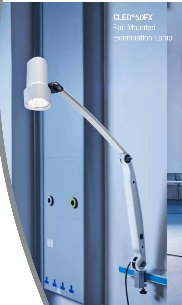
CLED®50FX Rail Mounted Examination Lamp