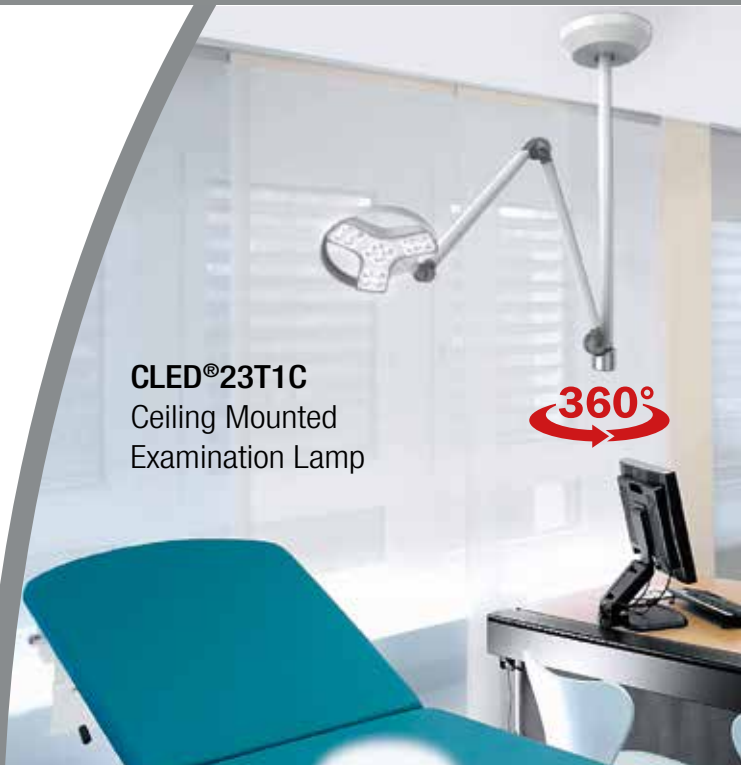
CLED®23T1C Ceiling Mounted Examination Lamp

CLED23 allows the user to adjust the colour temperature of the light source. This enhances the clinician's ability to recognise and distinguish tissue conditions. The warm white (3,500°K) setting is ideal for dermatological examinations and the daylight white setting (4,500°K) is ideal for the recognition of blood vessels.