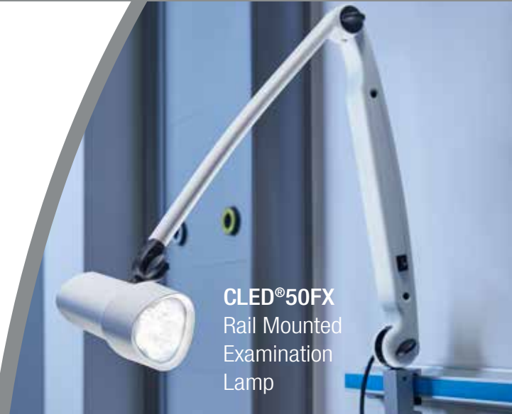
CLED®50FX Rail Mounted Examination Lamp