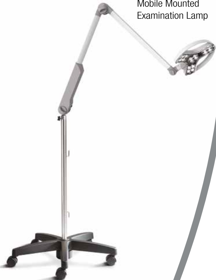
CLED®23TXMP Mobile Mounted Examination Lamp

The easy to use and ergonomic control pod allows all lighting to be adjusted with a simple press of the button.