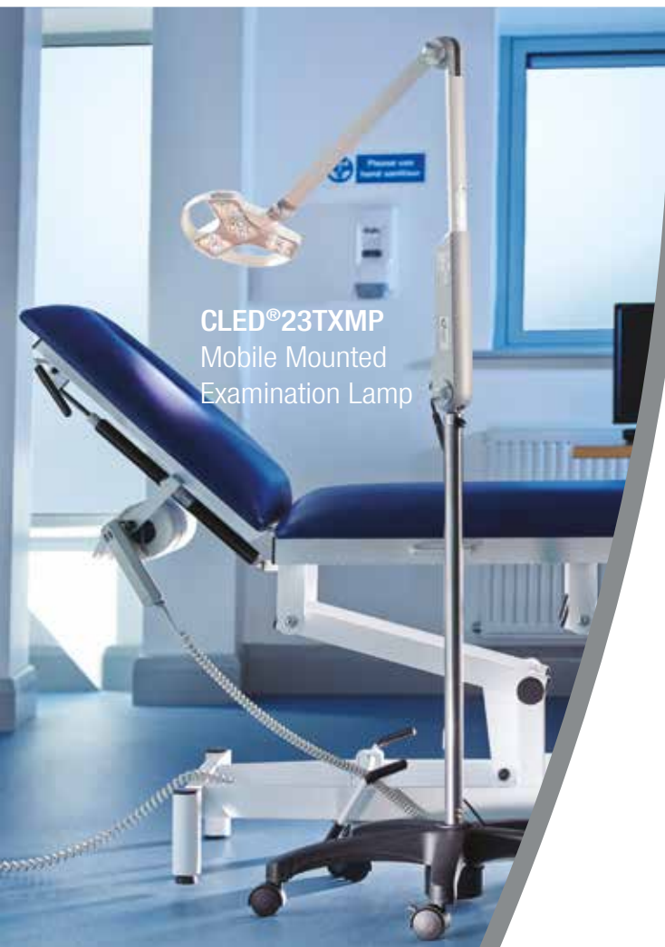
CLELED ® 23TXMP Mobile Mounted Examination Lamp